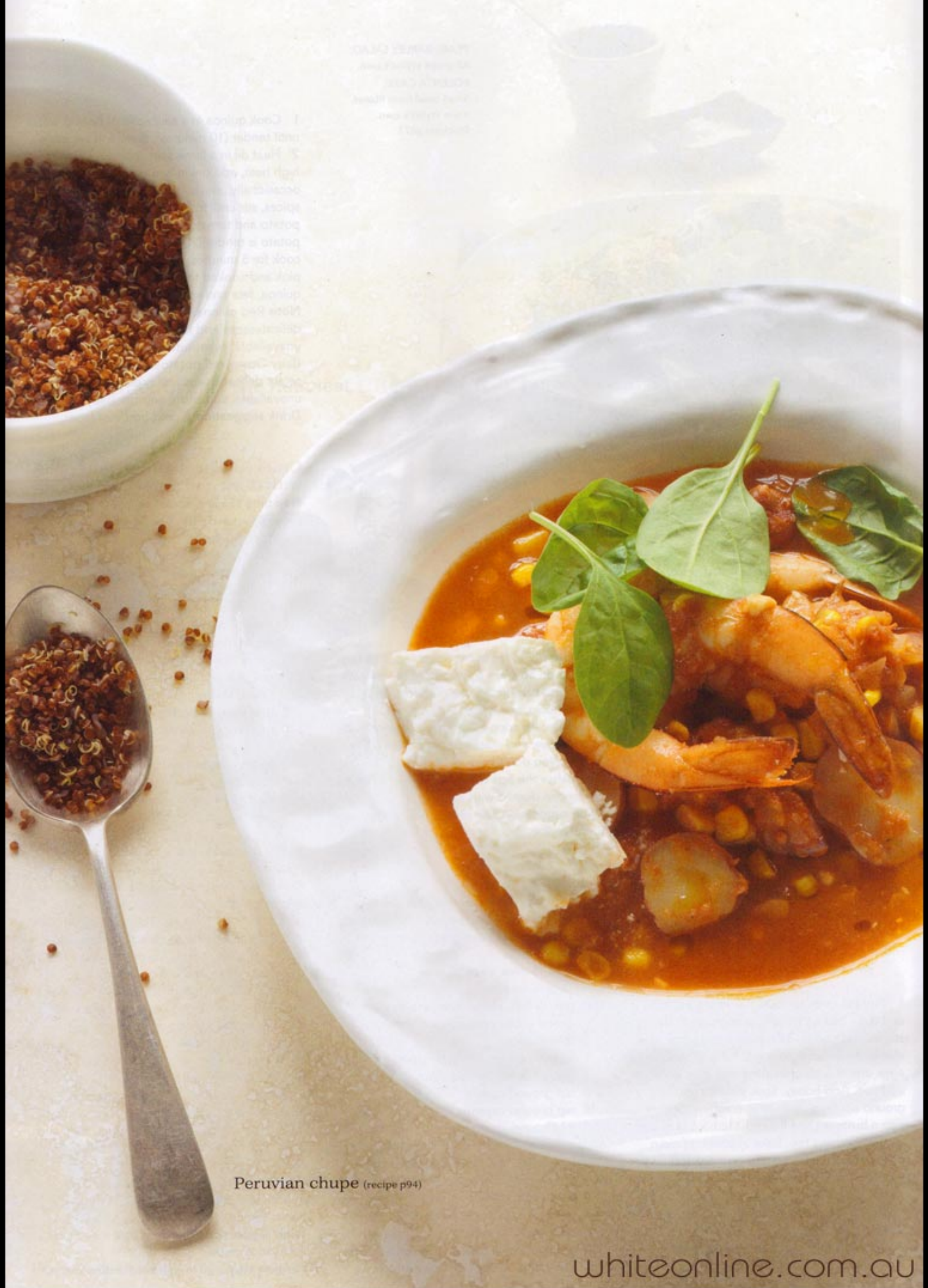
Peruvian chupe (recipe p94)