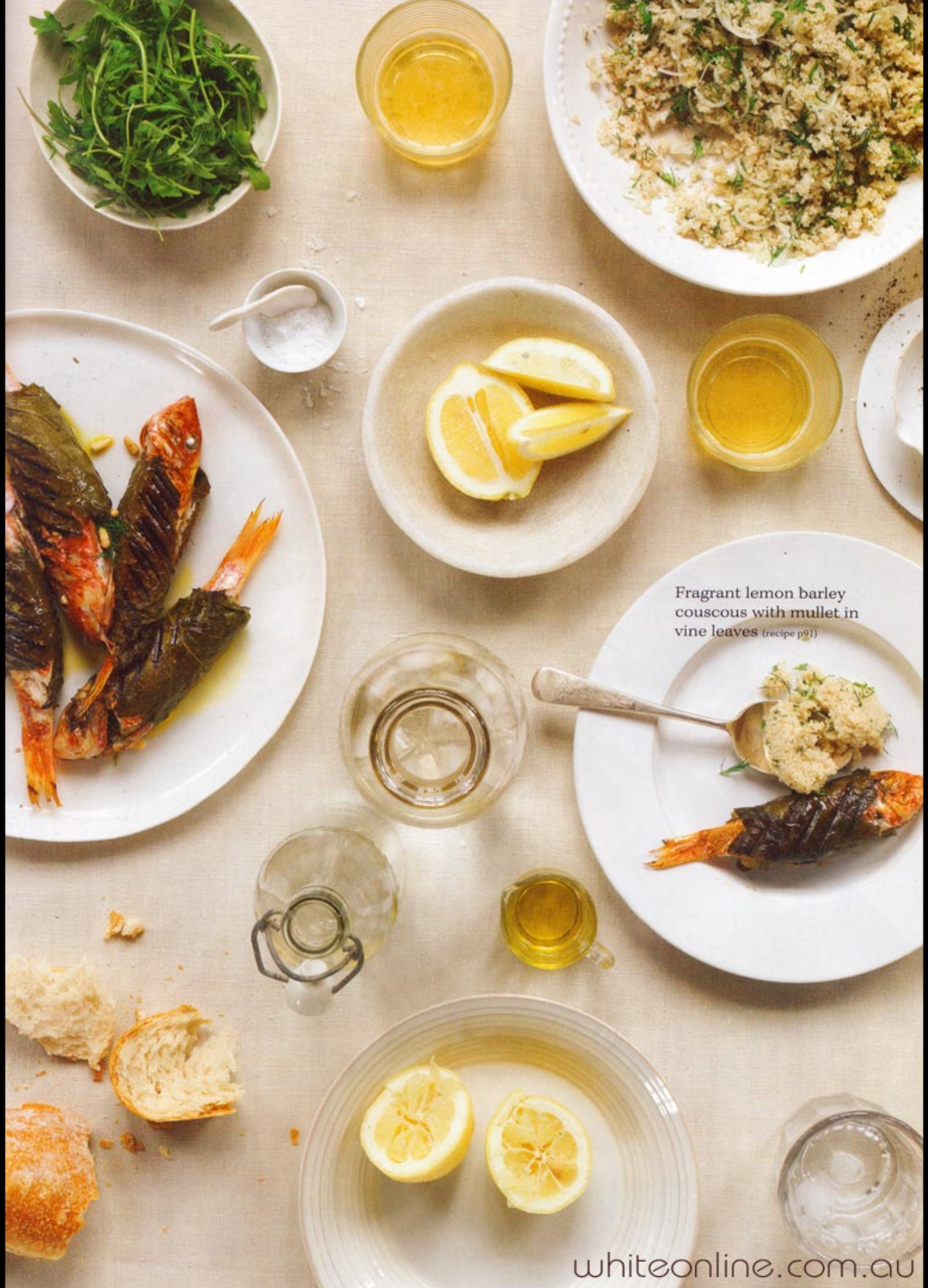
Fragrant lemon barley couscous with mullet in vine leaves (recipe p91)