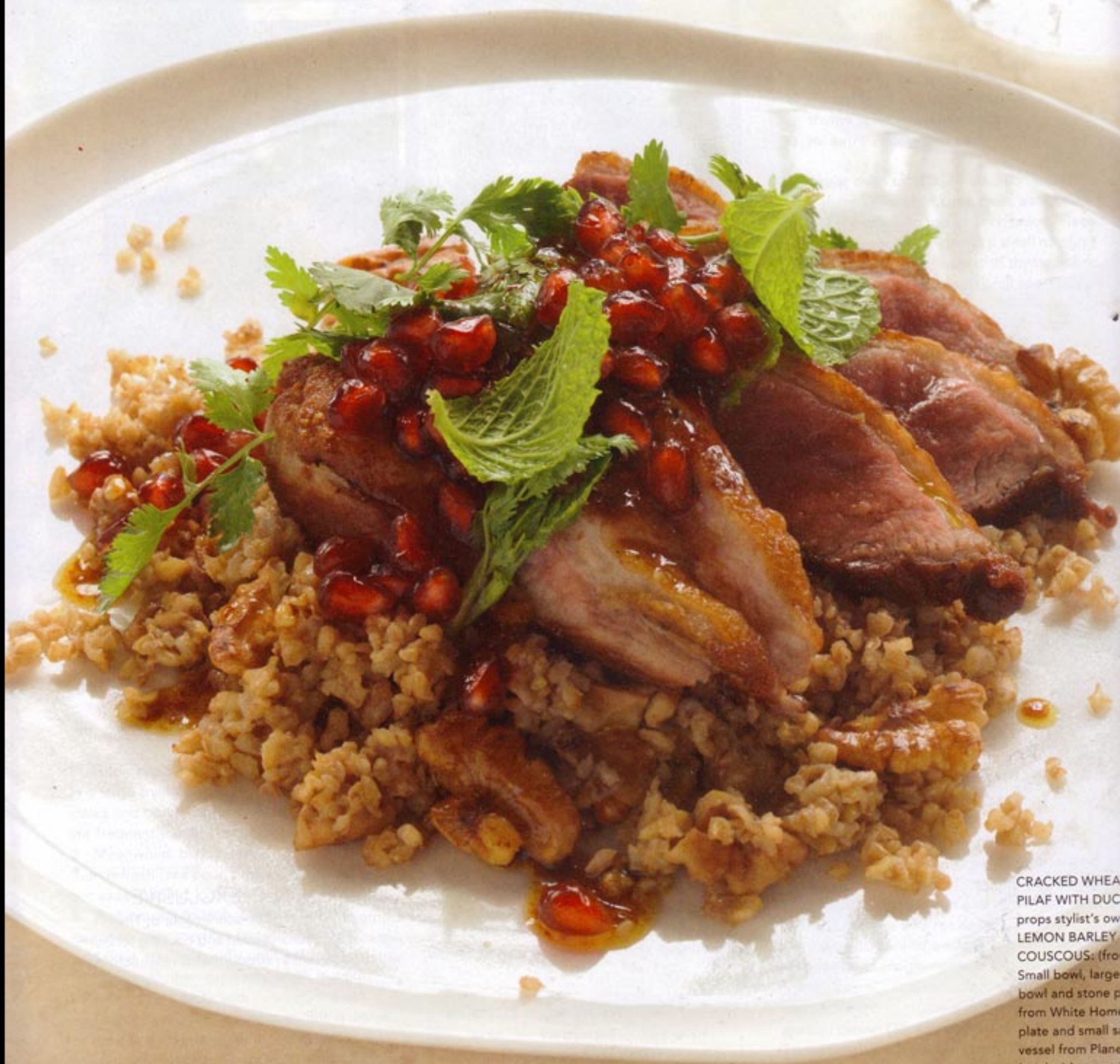
Cracked wheat and walnut pilaf with duck and pomegranates (recipe p94)

Recipes & food styling Lisa Featherby Drinks suggestions Max Allen Styling Mia Asker