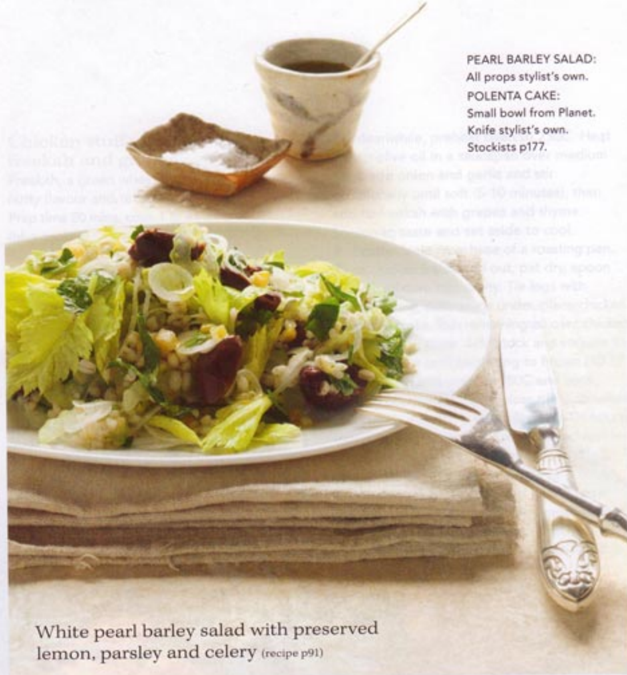
White pearl barley salad with preserved lemon, parsley and celery (recipe p91)

PEARL BARLEY SALAD: All props stylist's own. POLENTA CAKE: Small bowl from Planet. Knife stylist's own. Stockists p177.