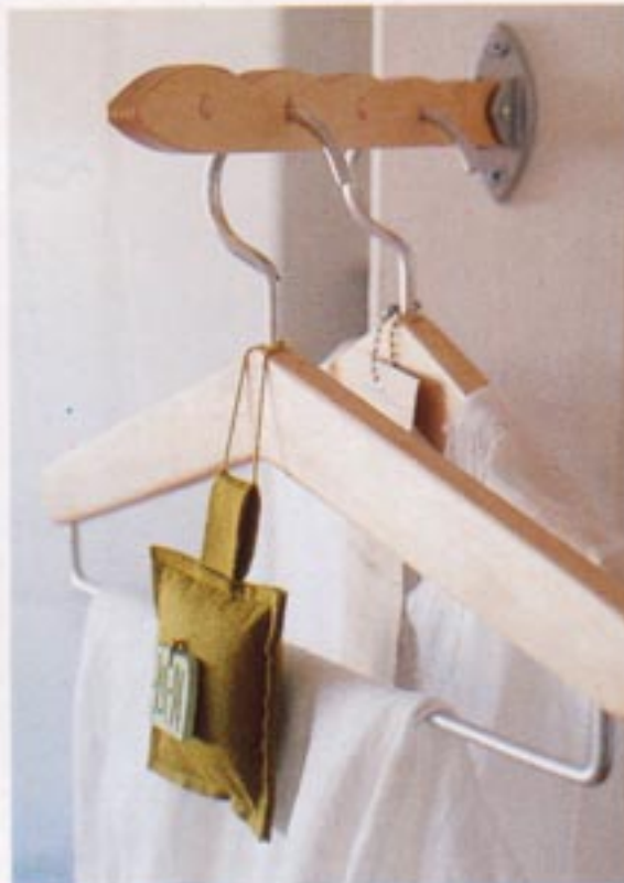
2 Doesn't that favourite outfit deserve some specially scented attention?