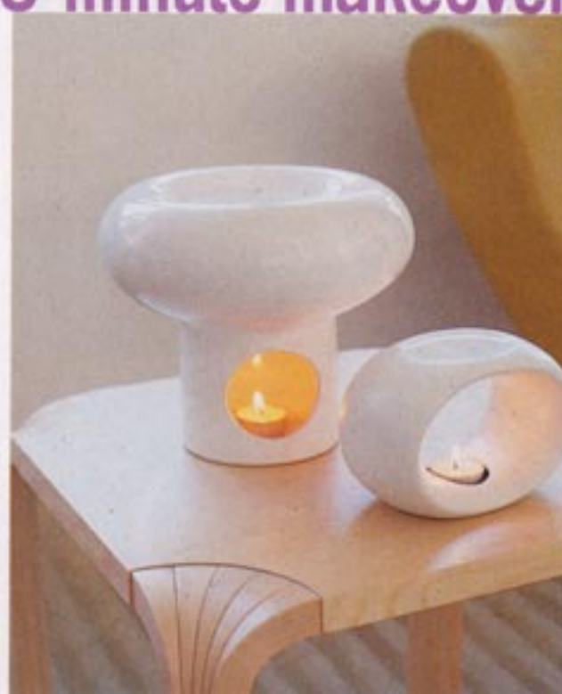
3 A few drops of essential oil is all it takes to revitalise and energise your soul