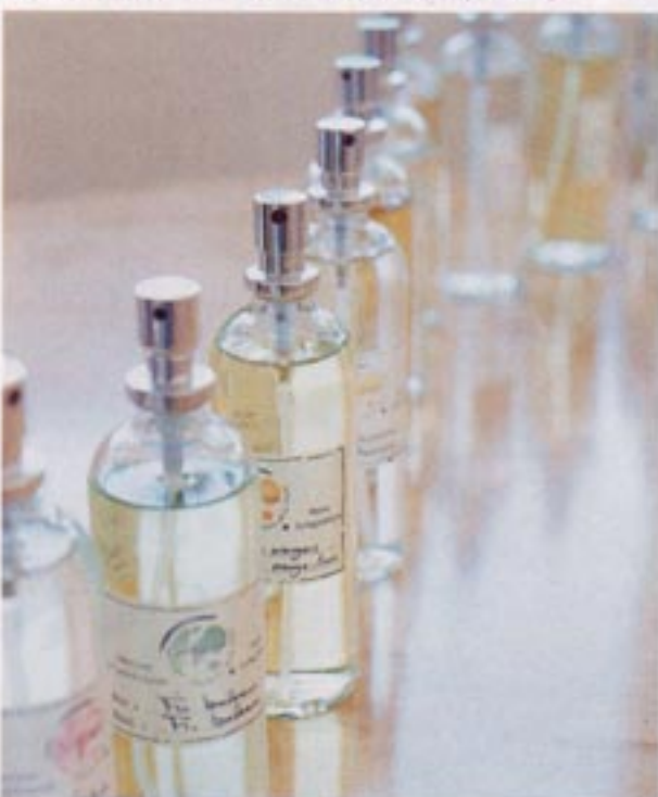
7 Brighten your environment – and your mood – with a fresh spritz of room spray