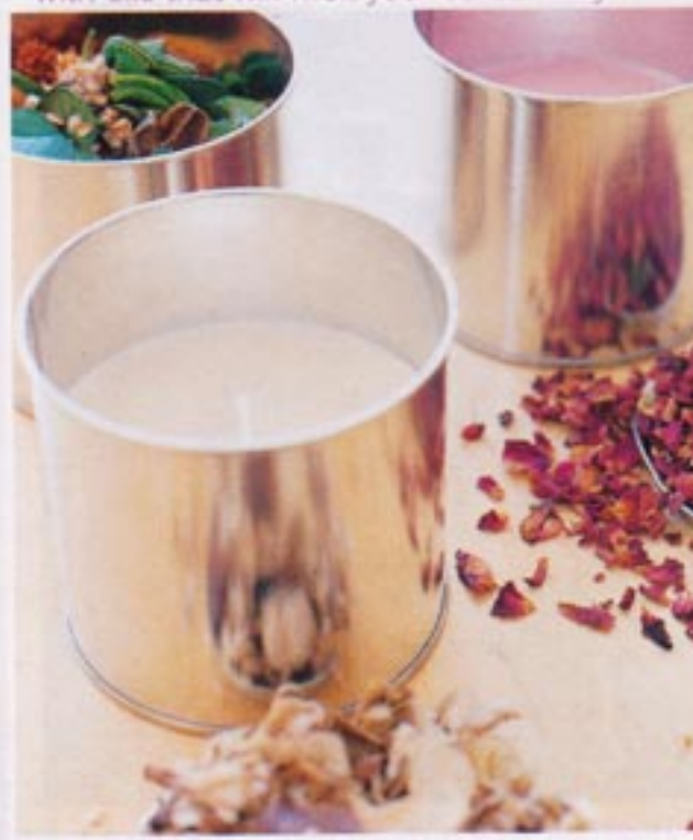
9 Potpourri's fragrant appeal is a colourful addition to a living room