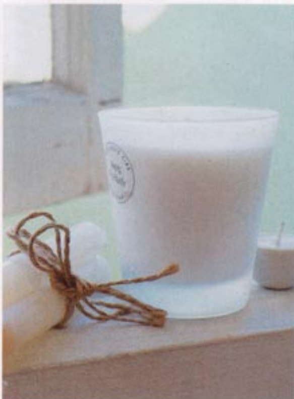
8 Delicately perfumed candles cast a flattering glow and seductive scent