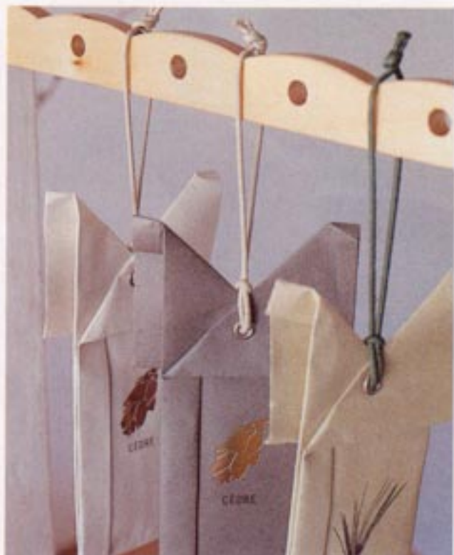
1 Calm your mind by scenting your clothes with soothing woody tones