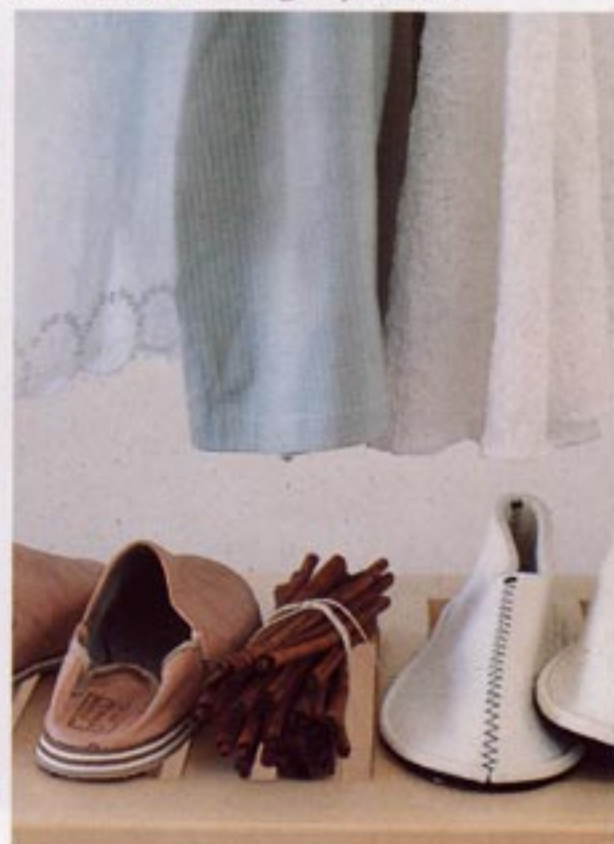
6 Look to your larder for ideas – try cinnamon sticks to neutralise shoe odours