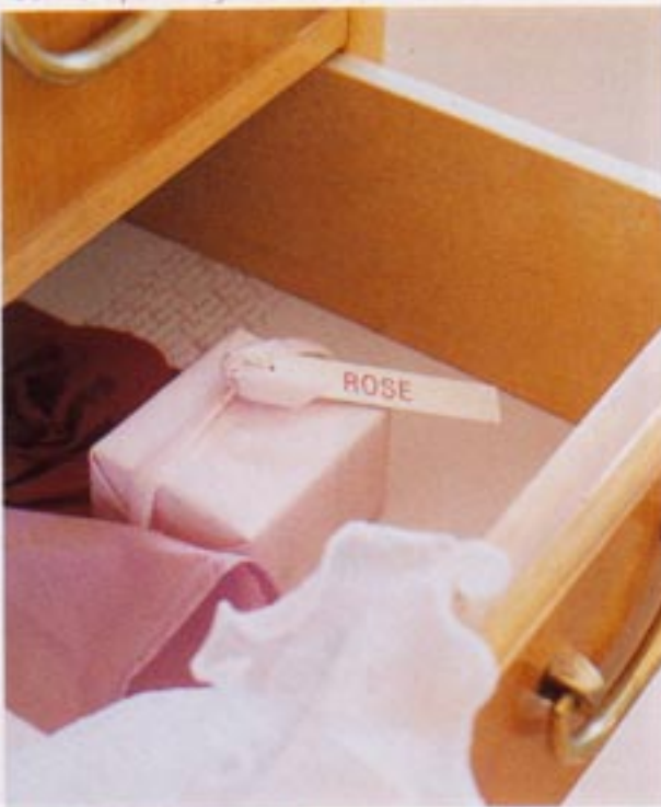
5 Grandmother's favourite: slip a rose soap in your drawer for lingerie that lingers