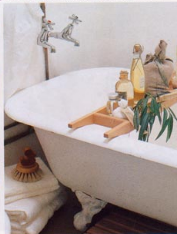
6 Aaaaah... slide into a hot bath softened with oils that will melt your cares away