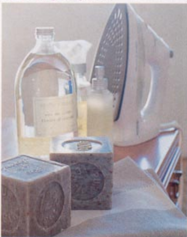
4 Floral-inspired linen water puts the joy back into laundry duty, so spray away...