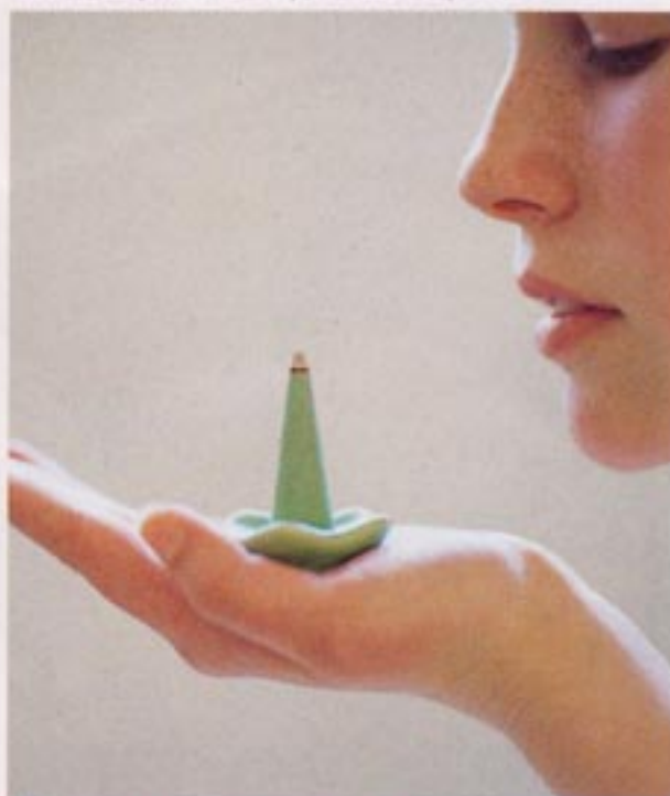
5 Burn incense cones for mesmerising ribbons of heady fragrance