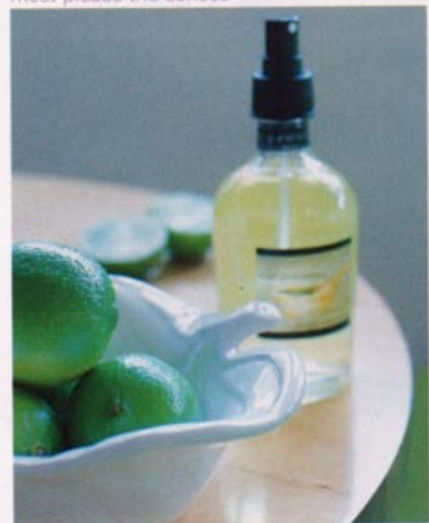
7 A cheery mist of lime zest is a deliciously natural anti-depressant