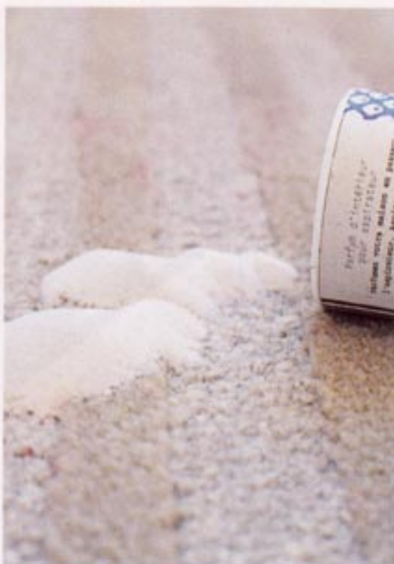
2 Freshen carpets while you vacuum, with a sprinkle of perfumed powder