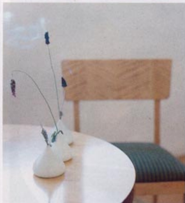
9 Spike pretty pots with single stems of smouldering, garden-fresh lavender >