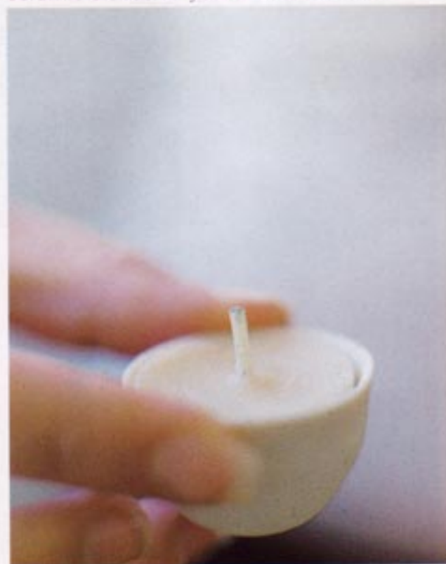
4 Often it's the smallest treats in life that most please the senses