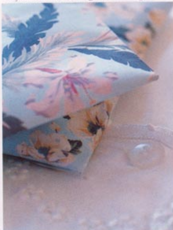
8 On display or hidden-away, perfumed paper bags are a girl's best friend