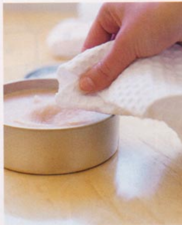
3 Wipe the frown from dull furniture with a gentle rub of restorative, fragranced balm